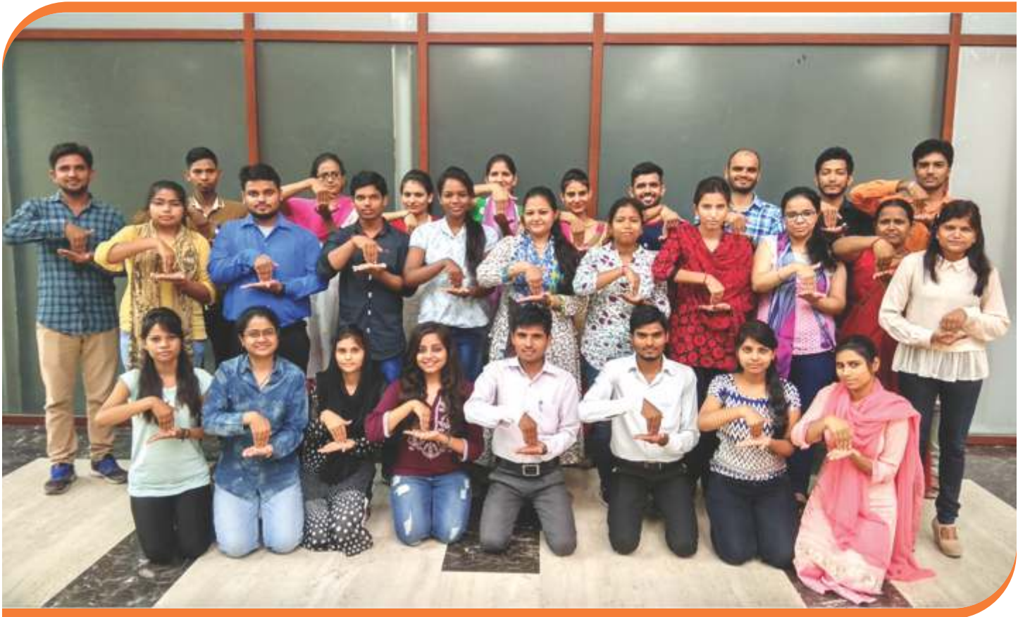
DISLI Students of ISLRTC

INDIAN SIGN LANGUAGE RESEARCH AND TRAINING CENTER (An Autonomous Organisation under the Department of Empowerment of Persons with Disabilities (Divyangjan), Ministry of Social Justice and Empowerment, Government of India, New Delhi) Registration Number S/1440/2016 (Delhi) A-91, 1st Floor, Nagpal Business Tower, Okhla Phase II, New Delhi-110020 Telephone : 011-26387558/59 Email : islrtcnewdelhi@gmail.com