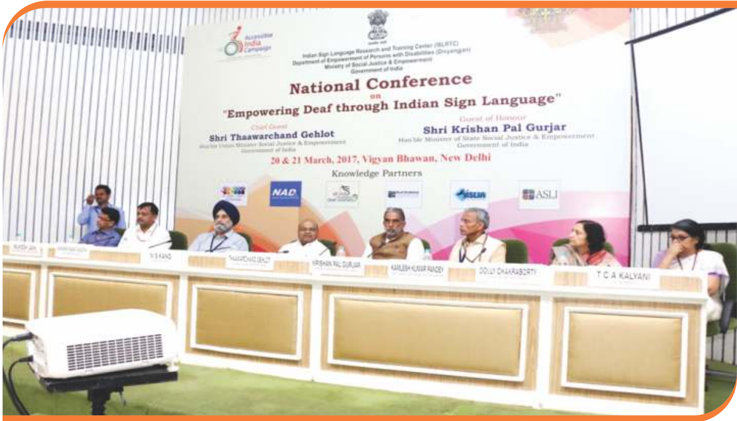
Dignitaries on the Dais during the National Conference by ISLRTC