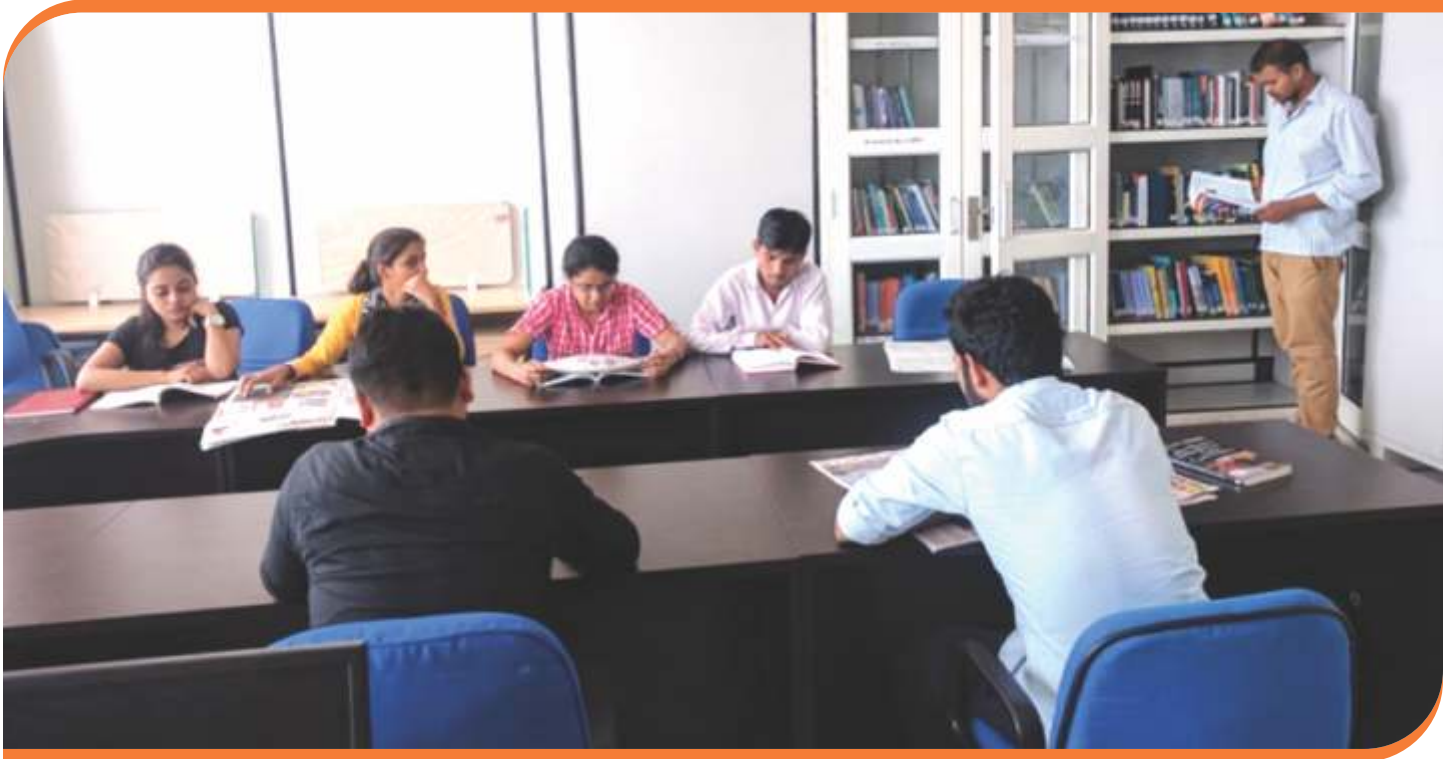
Library and Information Centre at ISLRTC